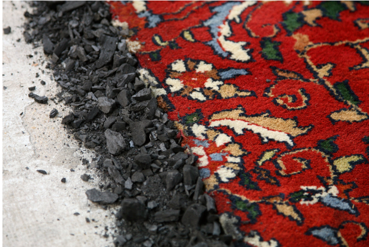
Tapis, 2024 Mohammed Alani carpet, coal 390x120x5 cm